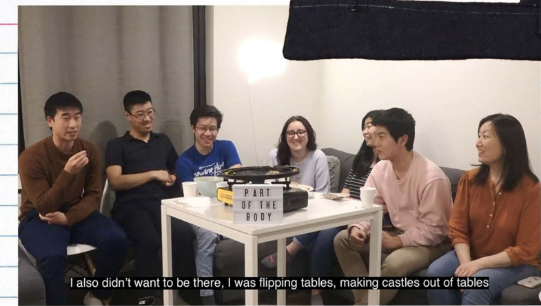
I also didn't want to be there, I was flipping tables, making castles out of tables